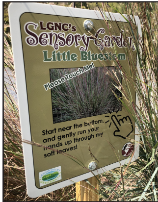
Over two dozen sensory-friendly native plants and signs!

This brochure is your guide to a fun and interactive learning experience that will introduce you to a variety of unique flora that call Pennsylvania home. As you follow the ADA-accessible paths outlined on the enclosed map, you will discover over two dozen sensory-friendly native plant species that you are encouraged to see, smell, hear, or touch! The sensory garden signs placed throughout the garden will help you find the plants and tell you more about them. Also look out for other sensory features in the garden, including musical instruments and please-touch tiles!