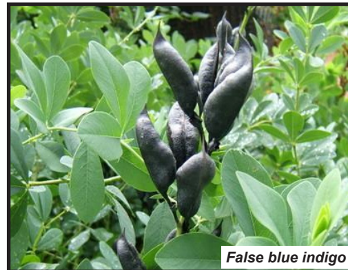
False blue indigo