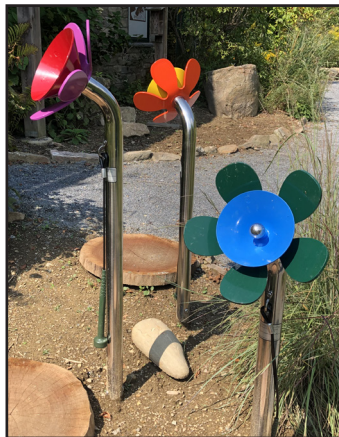
Outdoor musical instruments!