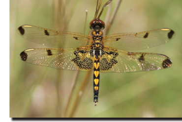
Calico Pennant Celithemis elisa to 1.4 in.