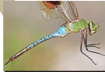
Common Green Darner Anax junius to 3.1 in.