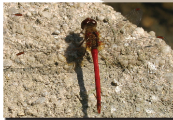
Autumn Meadowhawk Sympetrum vicinum to 1.4 in.