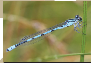
Familiar Bluet Enallagma civile to 1.5 in.