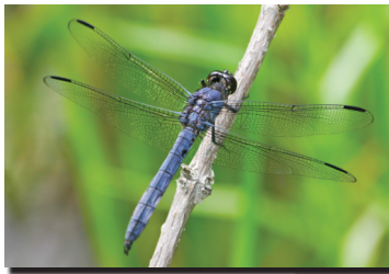
Slaty Skimmer Libellula incesta to 2.2 in.