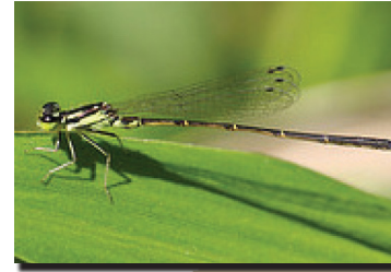
Fragile Forktail Ischnura posita to 1.1 in.