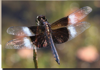
Widow Skimmer Libellula luctuosa to 2.0 in.