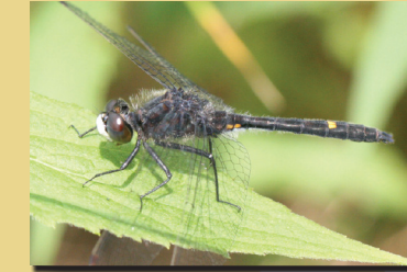
Dot-tailed Whiteface Leucorrhinia intacta to 1.3 in.