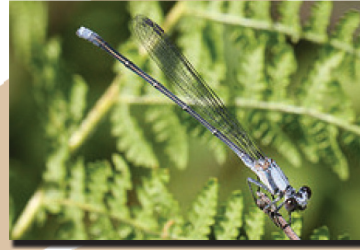
Powdered Dancer Argia moesta to 1.4 in.