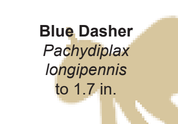
Blue Dasher Pachydiplax longipennis to 1.7 in.