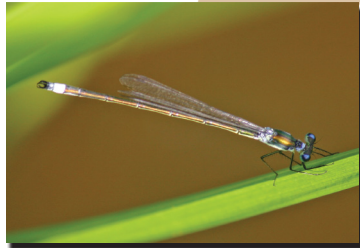
Elegant Spreadwing Lestes inaequalis to 1.9 in.