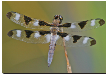
Twelve-spotted Skimmer Libellula puchella to 2.1 in.