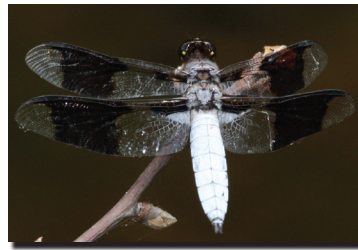
Common Whitetail Plathemis lydia to 1.9 in.