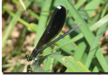
Ebony Jewelwing Calopteryx maculata to 2.2 in.